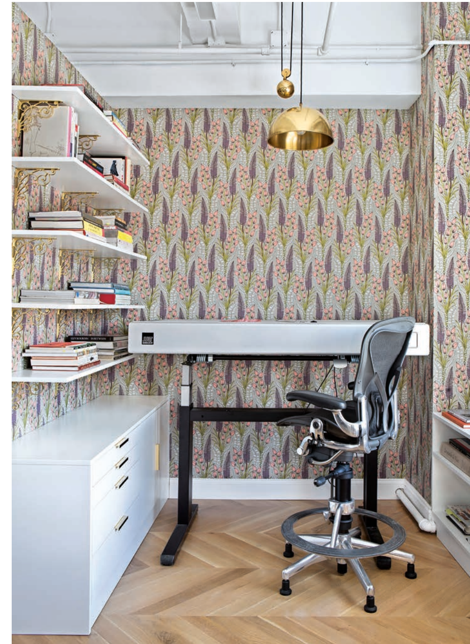
Honor Roll (THIS PAGE CLOCKWISE FROM TOP LEFT) In the entryway, a brass sign displays the seven-year-old label's name; it's mounted on a vertical garden by Flowerbox Wall Gardens. Abigail Borg's Foxtail Lily wallpaper is used throughout

“In six weeks, we created a whimsical, nature-inspired space without skimping on functionality” —Fawn Galli