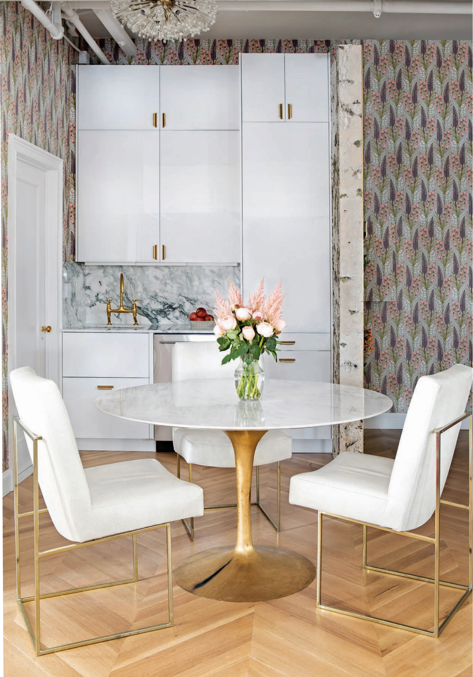
Fashionable Fare Milo Baughman for Thayer Coggin dining chairs, upholstered in Edelman Leather's Rattlesnake, surround a Carrara marble-topped Lucia B table in the kitchenette (THIS PAGE). Brass drawer pulls from Rejuvenation lend extra shimmer to the Ikea cabinetry; the backsplash is from ABC Stone. See Resources.