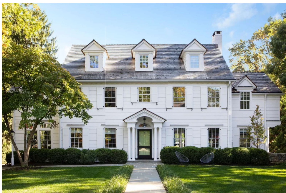
This updated home by Hiland Turner Architects maintains a sleek look thanks to its white shutters. The streamlined landscaping was handled by Leaf and Line.